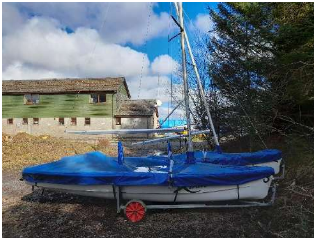
The cruiser parking area is to be used as the car park for this season.

Several members of the club attending the Opening-up Working Party, Sunday 27 th February. Work was done on the club house and the area where the cruisers had previously been stored was cleared of felled timber and readied for use as the main car parking area. The buoys were put out on the lake in anticipation of a return to racing. Two of the club Xenons were rigged and the Challenger dinghy assessed for rigging.